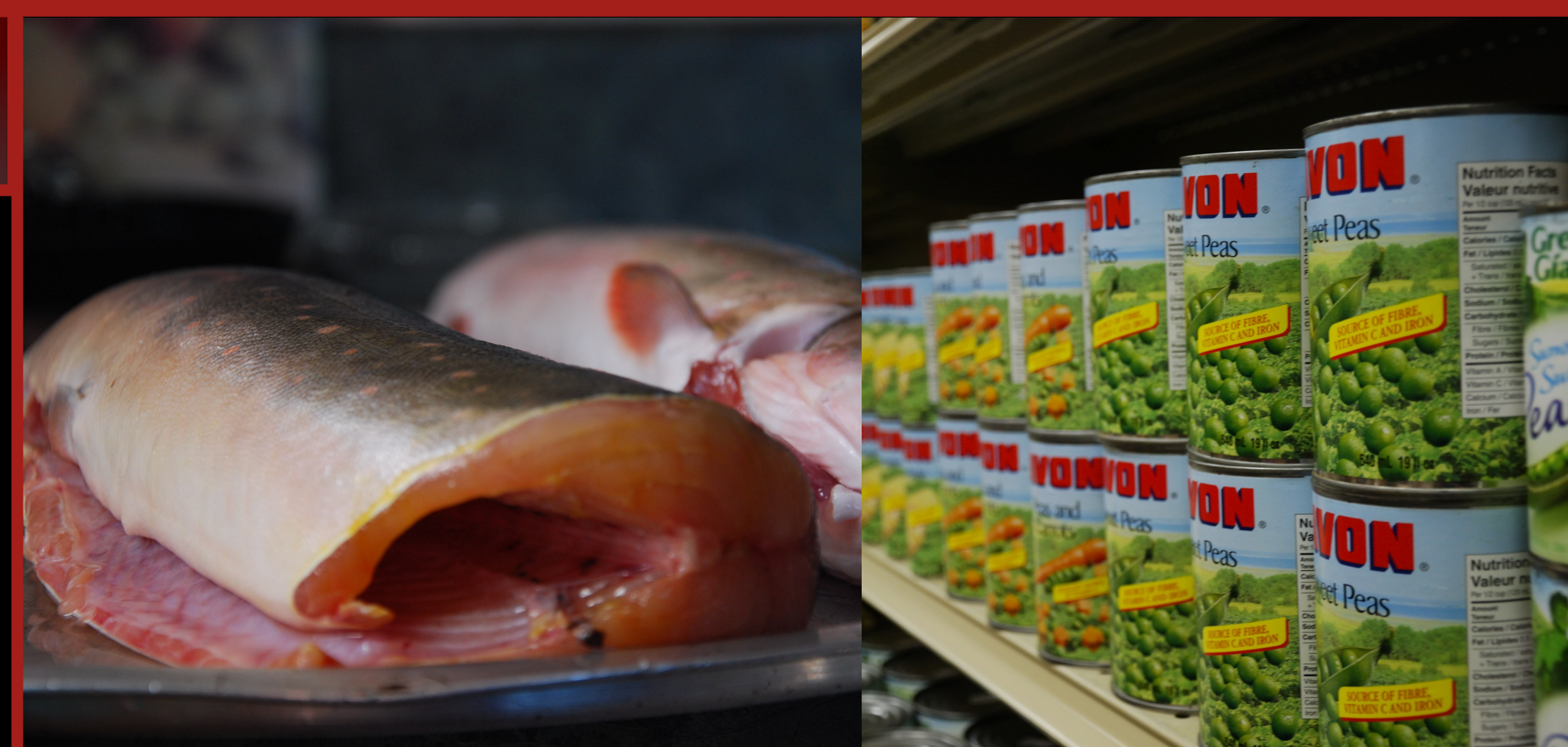
Photos depicting both the market and traditional food systems in northern communities.